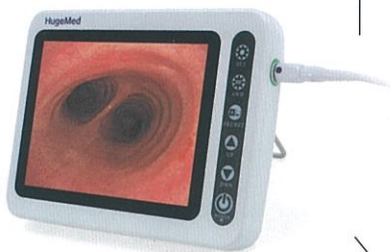
HugeMed™ BR Series BR-M22 2.2/0mm